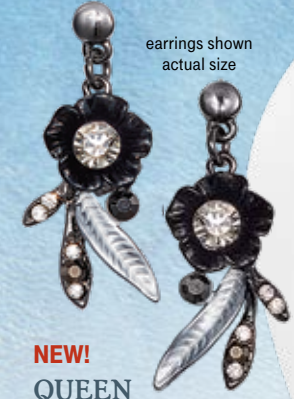
earrings shown actual size

On a cold, clear night, a shaft of moonlight reveals an owl, quietly watching the night. Subtly sparkling owl is made of feathers and other natural elements with a dusting of glitter. Adjustable wired feet. 6" high. Sold as single owl, facing random direction. D21157 Owl $21