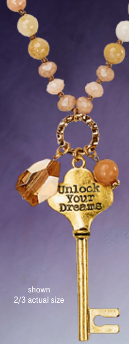
shown 2/3 actual size

One key to happiness—don't shut your dreams away. Golden key pendant exhorts you to "Unlock your dreams." Extra-long necklace of semi-precious stones and glass beads adjusts 33-36". Comes as a set with coordinating bead earrings. J90065 Unlock Your Dreams Necklace and Earrings Set $25